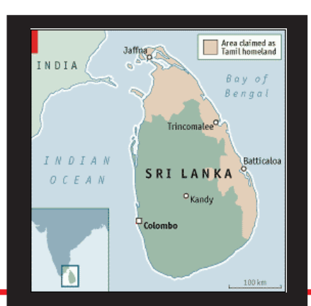
Tamil homeland designated in the Indo- Sri Lanka Accord of 1987

The island called Ceylon had three kingdoms, each with its own sovereignty, and territorial integrity and ruled by different kings, before the arrival of European colonialists. The British were the first to combine the three kingdoms under one administration in 1833. On independence in 1948, the British handed the entire island to the majority nation, the Sinhalese.