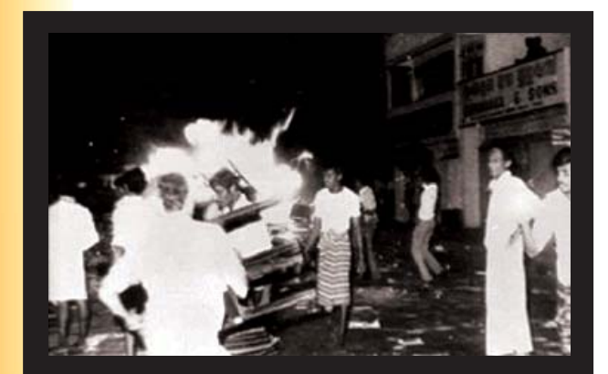
July 1983 anti-Tamil pogrom in which 4,000 died & 95% of Tamil industrial property destroyed.

It was after anti-Tamil pogroms 1956,1958,1961,1974, 1977, 1979, 1981 and the pogrom of genocidal proportions of 1983 that the Eelam War started.