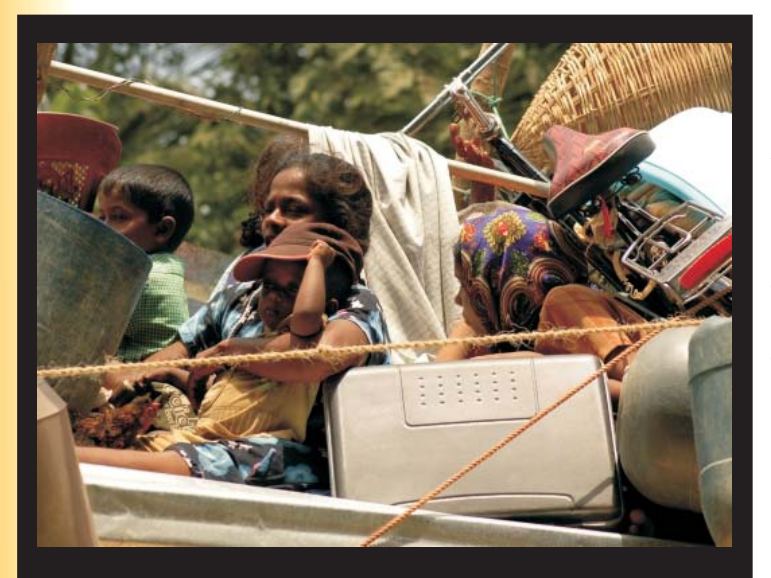
Tamil IDPs July 2008. One third of the Tamil population are IDPs, another third have fled overseas.

The 13th Amendment to the Constitution, introduced after the Indo-Sri Lanka Accord of 1987 that recognized the existence of the Tamil homeland and provided some autonomy for the provinces, has still not been implemented in full. The merger of the Northern Province with the Eastern Province has recently been declared invalid by a pliant Supreme Court. In addition, Tamil may have been declared an 'official' language, but the policy has not been implemented in practice.