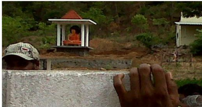
The Buddha statue erected close to where the Hindu temple once stood