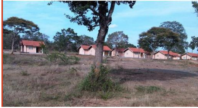
Houses built along the Madhu Road by Bank of Ceylon, 50 houses of which 45 are allocated to Sinhala families and 5 to Tamil families