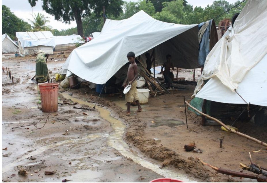
Conditions of houses in which people have been resettled in the Vanni

5.2 Move to Kombavil – Even the 7,440 persons who remain in the Menik Farm camps are scheduled to be moved to Kombavil, in the Puthukudiyiruppu Divisional Secretariat, instead of their places of origin. Kombavil is a remote area which lacks adequate infrastructure. The fact that it is located far from the sea affects the livelihoods of the relocated families as the majority of these families are engaged in fishing. The government has suggested that the reasons for this is that those places of origin are either being utilized for business and military purposes or that de-mining activities are still taking place in some areas, such as Puthumaththalan and Mullivaikkal.