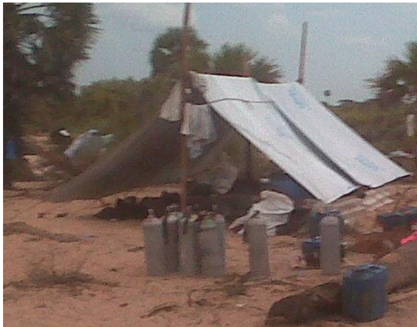
Diving equipment belonging to people brought from the South in Maruthenkerny