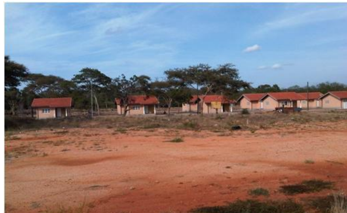
Houses along the Madhu road

7.6 Name boards – The trend of changing Tamil names of roads and towns to Sinhala names continues to be observed. There were several instances of complete removal of Tamil name boards and replacement with name boards only in Sinhala. This practice continues to concern local Tamil communities who view such acts as deliberate attempts to erase their identity. For example, three roads close to the A9 highway in Kanakarayankulam have been given Sinhala names - Kosala Perera road, Anura Perera road, and Rev Yatiravana Vimala Thero Street. The first two names are those of soldiers who took part in the war and the last one is the name of a Buddhist priest. Another example is the renaming of the Omanthai checkpoint as ‘Omantha’. The checkpoint is manned by Sinhala speaking soldiers. The Tamil name boards put up by the Municipal Council of Batticaloa along the border of Kattankudy have been