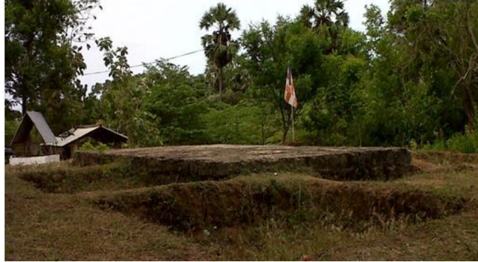
A Buddhist flag on the foundation of the Hindu Temple that has now been destroyed

there in that place. The previous report tabled by me in July also highlighted plans to install a statue of the Lord Buddha in Kinniya at a place where seven hot wells and a Pilliyar temple is situated where, for centuries, Hindus have performed certain religious ceremonies. The report also highlighted that Hon. Sampanthan had made a complaint regarding this this issue. The Hindu temple is now destroyed, and a Buddhist statute has been erected in the vicinity on the other side of the hot wells.