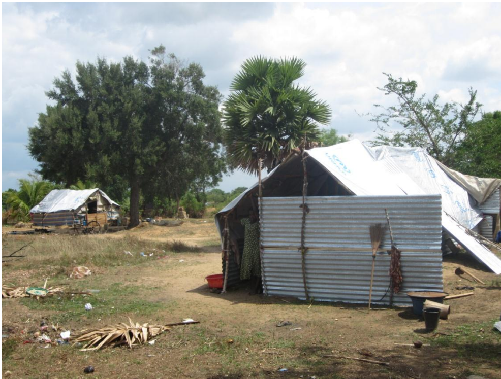
Houses in which people have been resettled in the Vanni

host families. Such persons include those displaced from Valikamam North in the Jaffna Peninsula, Sampur in the Trincomalee District, and several other areas in the Vanni. It was indicated in the previous report tabled by me in July that several families are unable to return to their homes as large areas of land have been taken by the military for camps and ad hoc 'High Security Zones' in Thirumurigandi, Shanthapuram and Indupuram, covering the districts of Mullativu and Killinochchi. These families have not yet been able to return to their homes and continue to live in camps, without the most basic facilities.