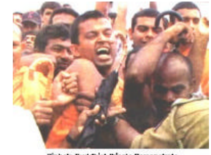
Sinhala Buddhist Priests Demonstrate in streets of Colombo, August 2000

In 1957, the Prime Minister Mr. Bandaranaike (current president's father) withdrew a pact with the