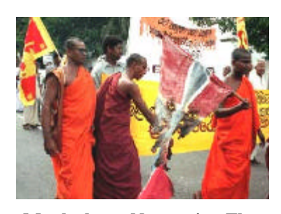
Monks burn Norwegian Flag

In 1965, Prime Minister Dudley Senanayake let another pact with the Tamils expire due to pressure from the Maha Sangha.