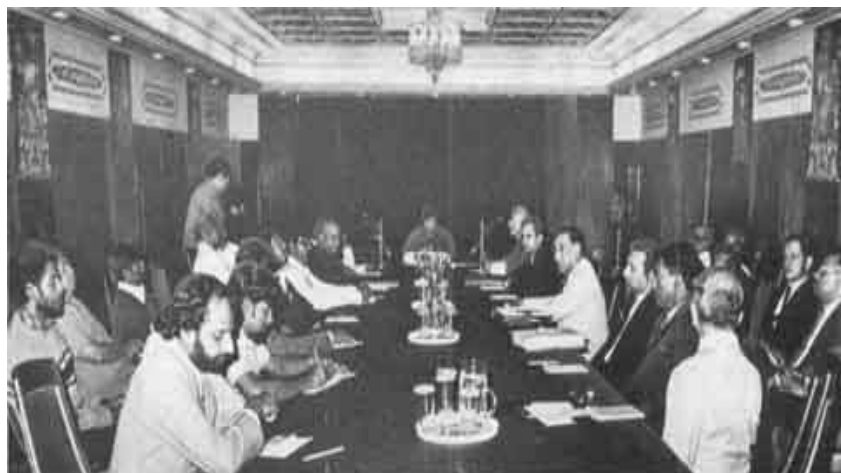
Phase I at Thimpu: The two delegations, the Sri Lanka government's and the Tamil, across the table.

The ethnic conflict in Sri Lanka is essentially a post-colonial phenomenon. The inability - or unwillingness - of the Sinhalese ruling class to come to terms with the multi-ethnic, multi-lingual, multi-religious character of the island's society has been at the root of the growing ethnic and social divide in the country. While